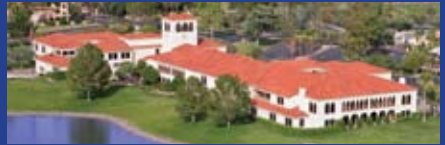
FOREVER LIVING CORPORATE PLAZA