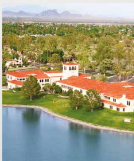
FOREVER CORPORATE PLAZA Forever Living's International Headquarters in Scottsdale, AZ

FOREVER LIVING PRODUCTS VISIT DISCOVERFOREVER.COM