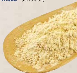
215 | Forever Multi-Maca® (60 tablets)

Forever Multi-Maca® combines legendary Peruvian Maca with other powerful herbs and select ingredients. It is cited that maca was eaten by Inca imperial warriors before battles. Their legendary strength was allegedly imparted by the preparatory consumption of copious amounts of maca, fueling formidable warriors. Contains soy.