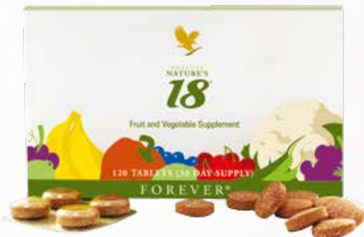
271 | Forever Nature's 18® (120 tablets)

Forever Nature's 18™ is an easy –to chew tablet that delivers nutrients and other benefits from fruits and vegetables. Forever Nature's 18™ is a Forever Living's way of assuring you that 18 fruits and vegetables extracts are conveniently at your disposal.