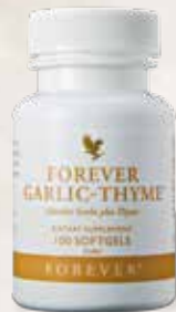
065 | Forever Garlic-Thyme® (100 softgel capsules)

Garlic and Thyme, the two powerful ingredients found in Forever Garlic Thyme™, combine to create a great tool in maintaining good health. The dietary use of garlic and thyme has been traced back thousands of years. These legendary herbs are now being studied by modern science because of their potentially beneficial properties. Contains soy.