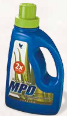
307 | Forever Aloe MPD® 2X Ultra (946 ml)

A biodegradable, multi-purpose detergent concentrate that's great for lifting grime, cutting grease and removing stains.