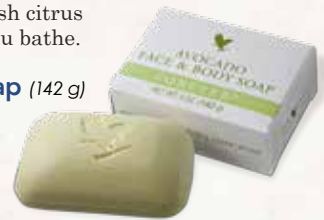
284 | Avocado Face & Body Soap (142 g)

Forever Hand Sanitizer® is designed to kill 99.99% of germs. Our moisturizing formula contains skin-soothing stabilized Aloe Vera gel along with the hydrating goodness of honey.