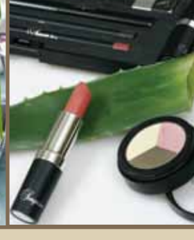
Introductory Combo Samples of products and literature to begin building your business.