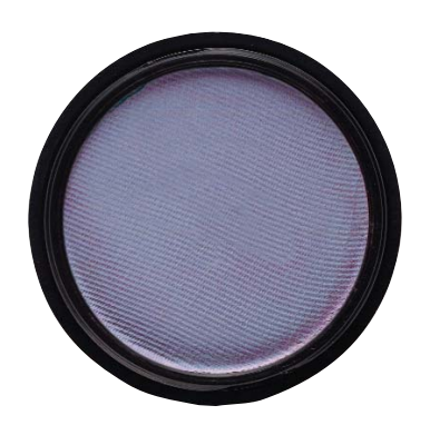
Blue Bayou 136