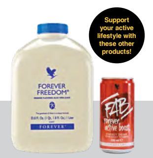
Forever Freedom® & FAB Forever Active Boost® Page 12